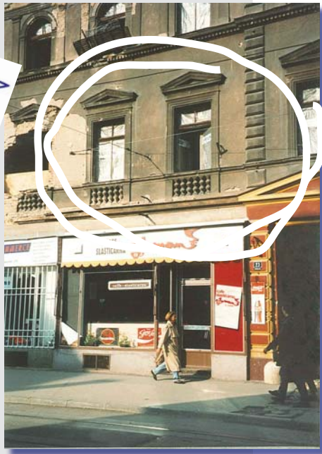
Sarajevo, 1994: Building of the 1st WUS Austria Sarajevo Office in Marsala Tita Street