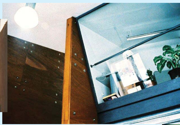
Access centre today