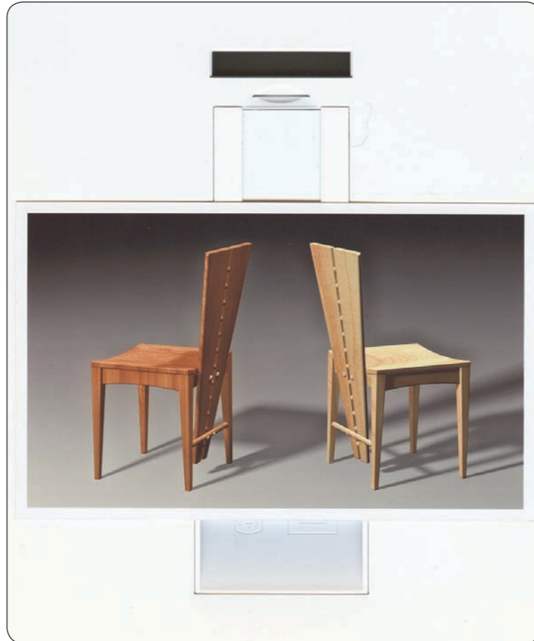
Exhibition of students at Faculty of Technical Engineering, University of Bihac

From the point of view of a person who has benefited from the BGP project assistance in improving the quality of the teaching process, I must say that the BGP project has met all the criteria and justified its role. With their great understanding and wholehearted assistance, the team members have always tried to find the best solution. The possibility of