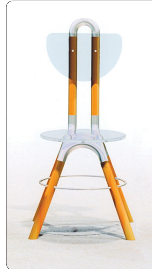
Exhibition of students at Faculty of Technical Engineering, University of Bihac

I think that the project should continue its work and therefore I give my full support to the BGP project implementation team, and I hope to continue the cooperation which has proved very successful so far. I sincerely