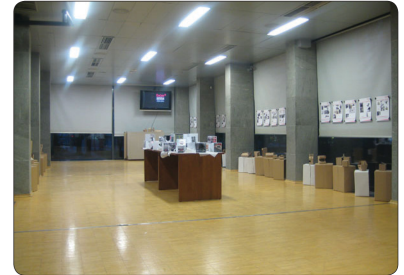
Exhibition of students within the course Visualization and Modeling

After five years of participation in the Brain Gain Program, as a guest lecturer at the Faculty of Architecture and Civil Engineering at the University of Banja Luka, it is my pleasure to observe the remarkable development that took place at my host Faculty. Thanks to the project's longevity we managed to establish a modern teaching structure in geometry and digital media which led to 2 workshops resulting in exhibitions of students' works that will also be presented at the next CAD Future conference in Liege ( www.agfbl.org/vim2/doghouse2009 and www.agfbl.org/vim2/box2010eng ). Therefore, I would like to emphasize that this was possible only due to the long-term support by WUS and an extremely friendly and positive atmosphere at the University of Banja Luka.