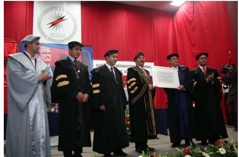
Doctor Honoris Causa to Mr. Sali Berisha