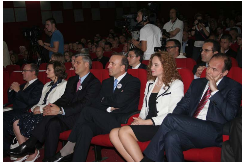
Doctor Honoris Causa to Mr. Tony Blair