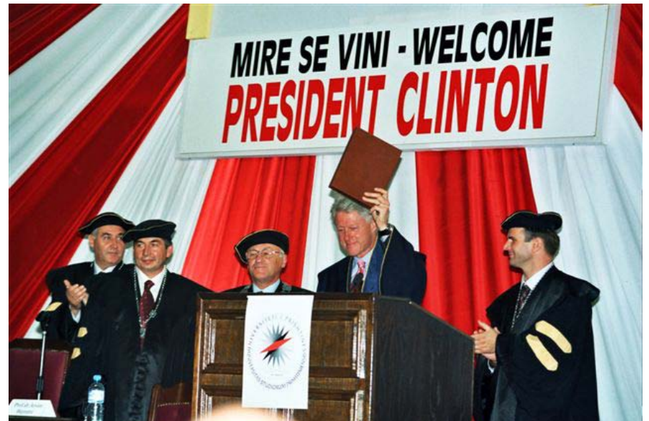
Doctor Honoris Causa to Mr. Bill Clinton