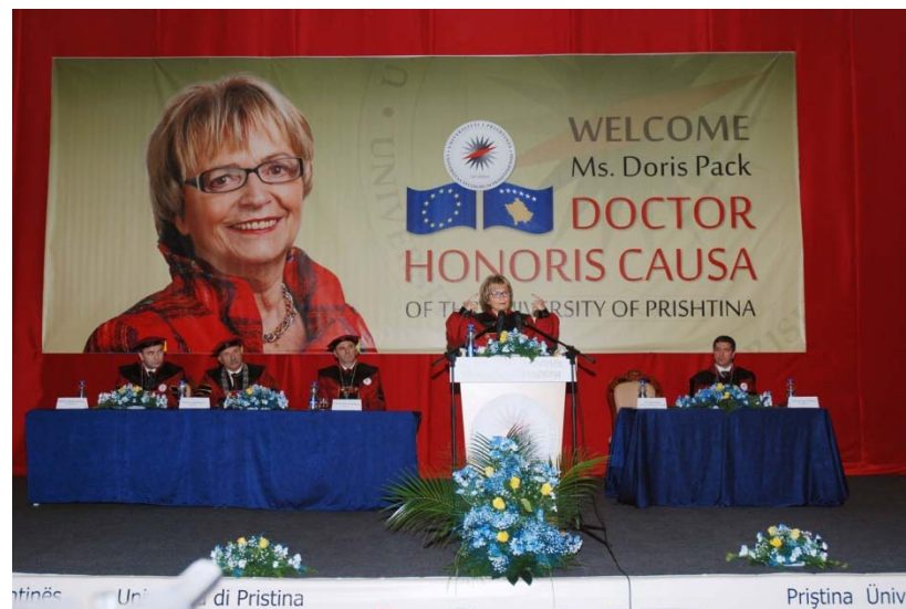
Doctor Honoris Causa to Ms. Doris Pack